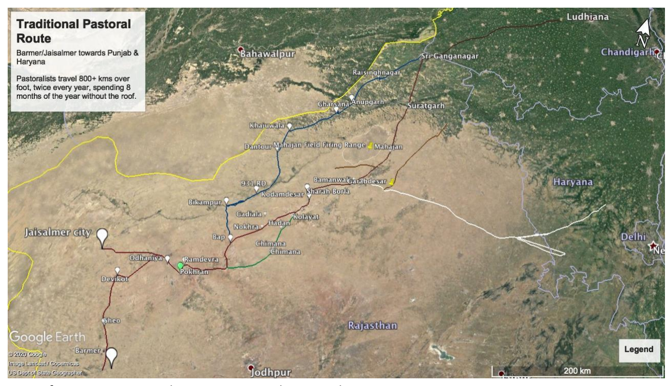
Map of two major pastoralist routes mapped in Rajasthan

Under the FAO funded project titled "Reviving Traditional Pastoralist Routes in Dry and Arid Parts of the Country" efforts were launched in December 2019 in the 4 programme sites in Dhani Bhopalaram, Kalu, Kelan and Rajasar Bhatiyan in Lunkaransar block, Bikaner district, Rajasthan. The document would cover the key activities undertaken until May 15, 2020, and proposed activities until the end of April 2021. The proposed activities and its relation to the approved results framework, deliverables, and timelines as per the revised Letter of Agreement would be discussed in detail in this report. In addition, challenges and effects of the ongoing COVID-19 pandemic and its effects on the deliverables of the project would be discussed as well.